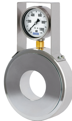
Hydraulic ring force transducer, model F6137

This hydraulic force measuring unit can, in conjunction with a measuring or display instrument, display the measured values directly or output them as analogue signals. A cylinder-piston combination, filled with hydraulic medium, in a steel version with surface coating or in stainless steel version (option), forms the basis of the anchor force measuring system. It is an extremely robust design in line with the requirements of geotechnical engineering.