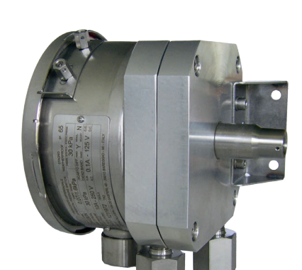
Differential pressure switch, model DW03UN